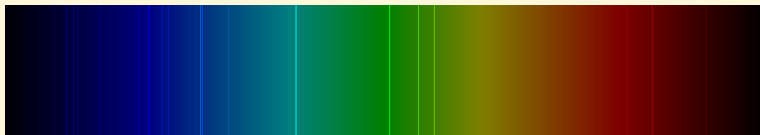
light spectral lines of the element rubidium

In technology Rb is sometimes used in solar cells, and a possible projected future use might be in deep space exploration, as it would enable the creation of ion drives, which effectively inspired the music in this album.